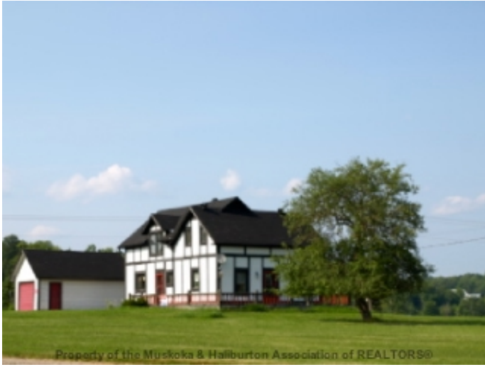
Property of the Muskoka & Haliburton Association of REALTORS®